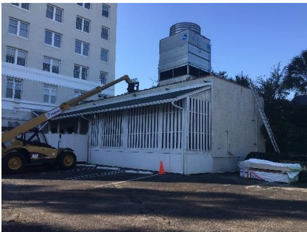
Photo on the right is of workers removing the old roof.